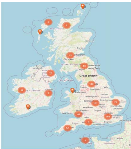
Caption: Interactive map of community archives

The CAHG community archives directory is the single best listing of community archives in the UK and Ireland. It contains over 750 archives, which you can see displayed on our interactive map .