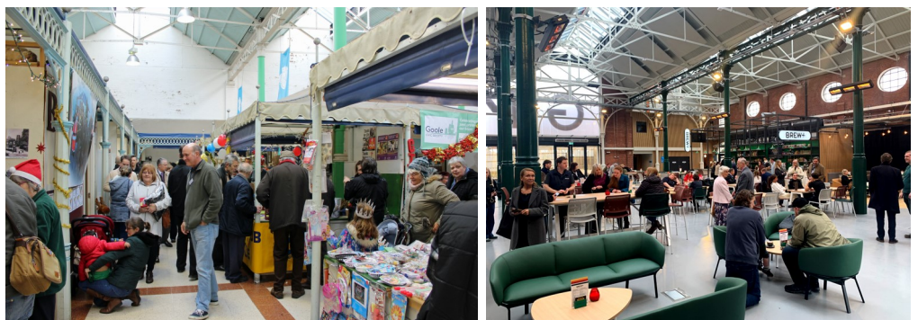
Before (left) – the tired Market Hall interior with its fixed stalls. After (right) – the restored light-filled hall with plenty of flexible space.