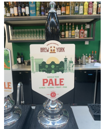
Goole Tide Pale – the town's bespoke brew.

Its new operator is Brew York, a craft brewery with venues across Yorkshire, which intends to make it a meeting hub for the whole community with a variety of street food vendors, coffee shop and bar serving Brew York beers - including a new 'Goole Tide Pale' (right). It will host live music and a variety of community events and activities.