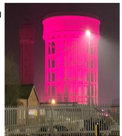
Goole’s Salt and Pepper Pot water towers all lit up for the Bicentenary event.

More than 3,000 people from a population of 20,000 watched the ‘Shine on Goole’ light projection on the Parish Church, depicting the town’s history. The event, staged by East Riding