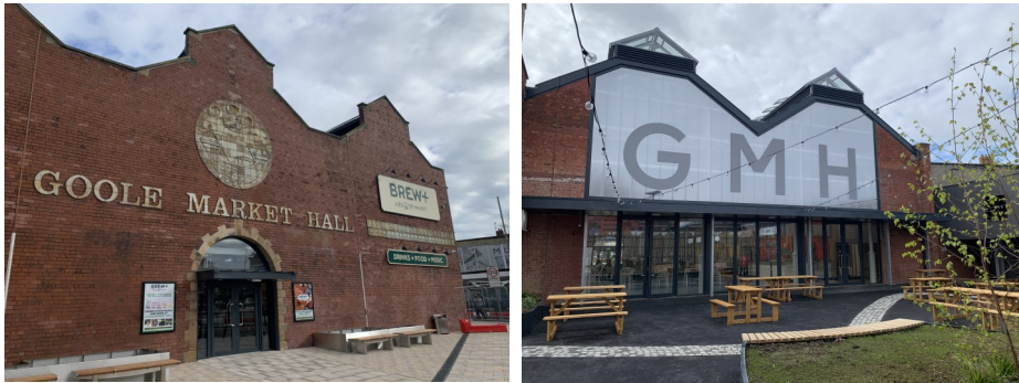
Goole Market Hall frontage (left) A new community garden at the rear (right)

More than seven years of perseverance by Goole Civic Society was rewarded on 2 nd April when Goole's restored Victorian Market Hall enjoyed a grand reopening as an impressive food, drink and community events venue.