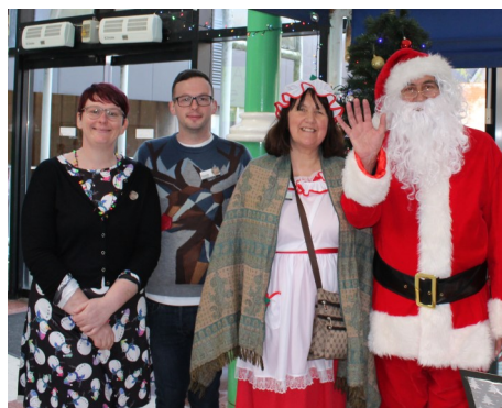
The committee launching their campaign to save the Market Hall in 2018. Guess who was Santa!

However, the people of Goole felt very strongly attached to the Market Hall so the Civic Society began a campaign to preserve it for the community. In December 2018, as the market prepared for closure, the Civic Society rented out all the vacant stalls and invited local community groups to use them for a Christmas event to promote the campaign and demonstrate the strength of feeling in the town.