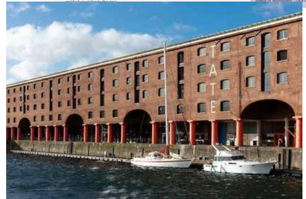
The Tate, Liverpool